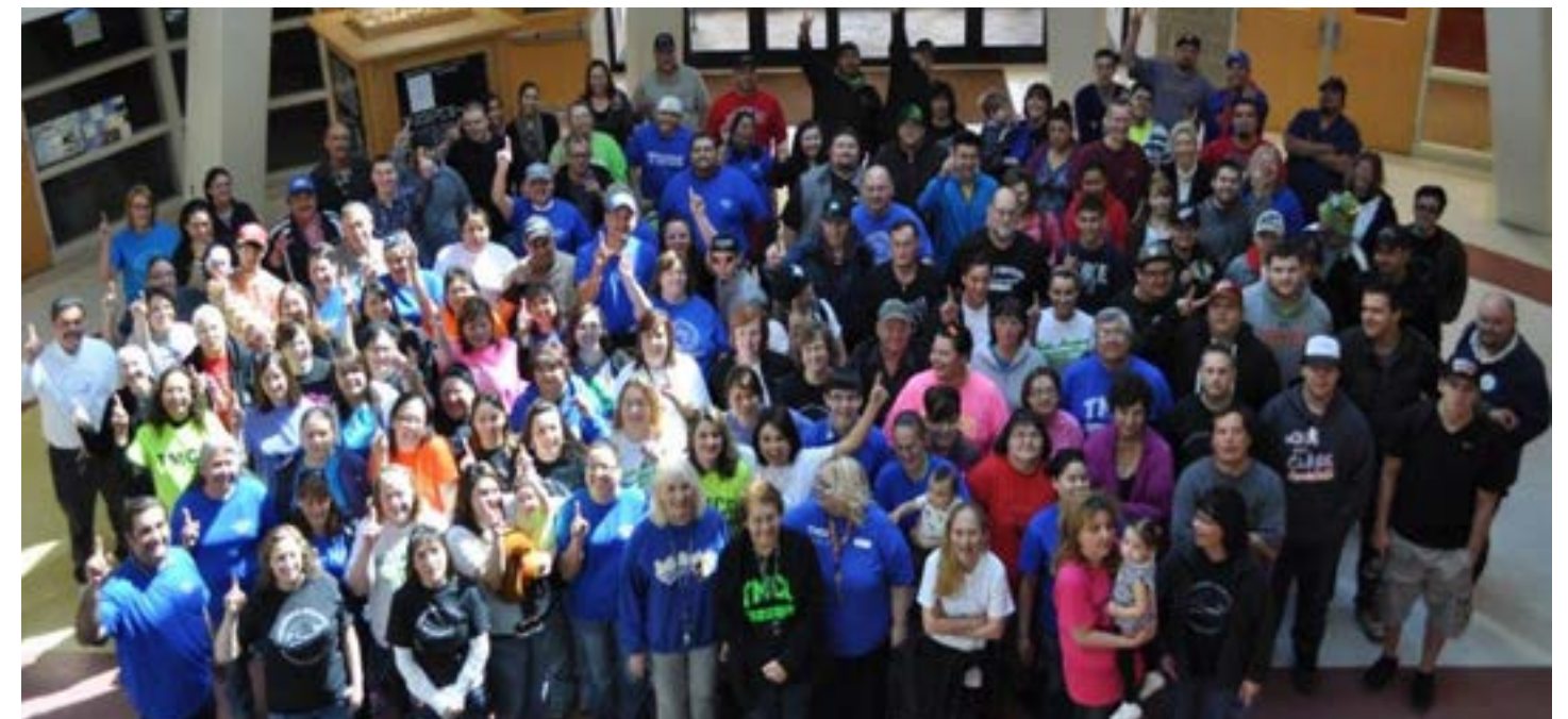
Students at the Turtle Mountain Community College